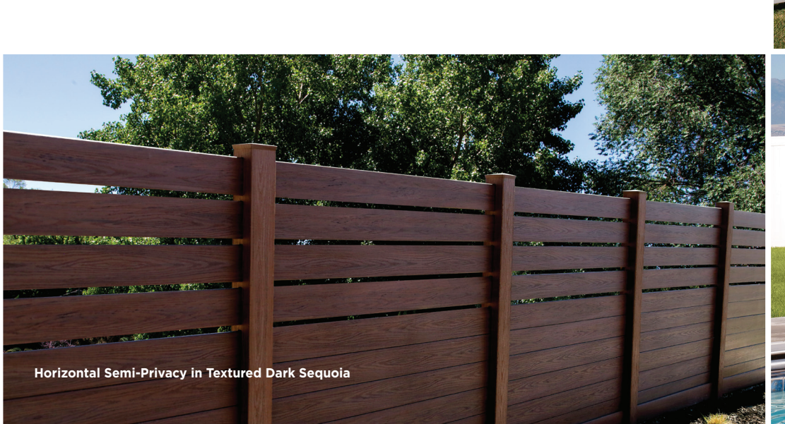
Textured Timberland Series